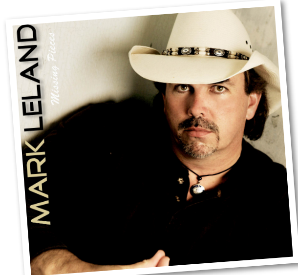
The "Missing Pieces" CD